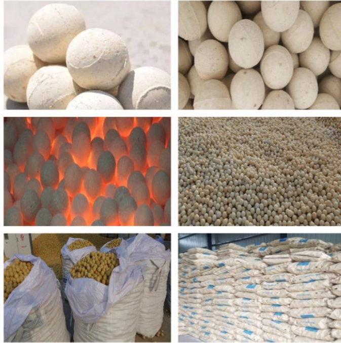
Product Specification of High Alumina Refractory Ball

protecting catalyst role, can also be used in heating furnace of iron and steel industry and the transformation of equipment, ordinary refractory ball suitable for sulfuric acid and fertilizer industries converter and transform furnace, high aluminum refractory ball is suitable for industries such as steel, urea, hot blast furnace, heating and transformation furnace and other equipment.