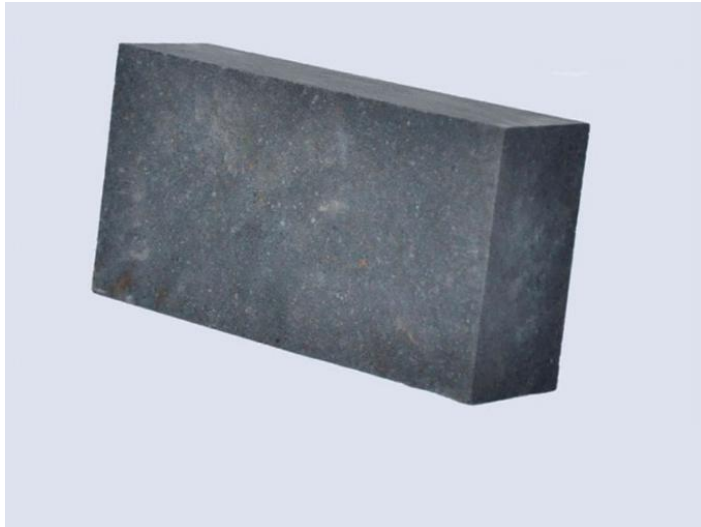
Physical And Chemical Indicators of Silicon Carbide Bricks For Blast Furnaces:

The silicon carbide refractory bricks produced by Rongsheng Refractory for the chemical industry are made from high-quality 98% SiC as raw material, using oxide as a bonding agent and undergoing high forming and high-temperature firing. They feature high-temperature strength, excellent wear resistance, corrosion resistance, high thermal conductivity, low thermal expansion coefficient, good thermal shock resistance, and strong thermal radiation properties.