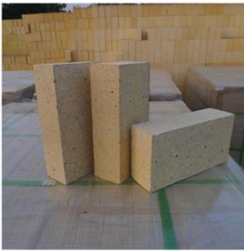
Key Features of 60% & 75% Al2O3 Refractory Brick for Heating Furnace Lining: