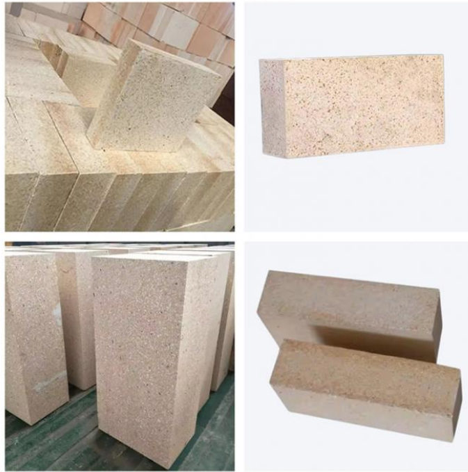
Product Specification of Silimanite Brick Furnace Refractory Brick For Glass Kilns