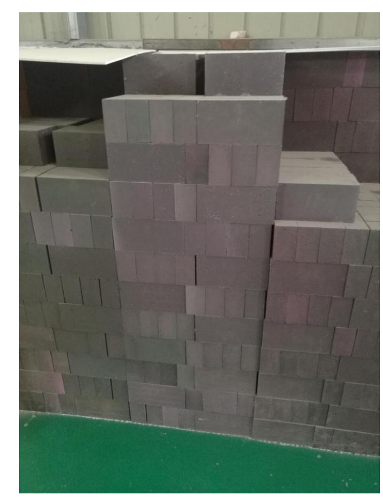
Key Advantages of Rongsheng Refractory Chrome Corundum Bricks:

High Mechanical Strength: Our chrome corundum bricks boast superior compressive strength and flexibility, ensuring durability under heavy loads and high temperatures.