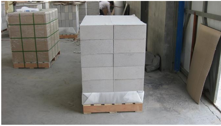
Technical Specifications of Rongsheng Refractory Phosphate Bonded High Alumina Brick: