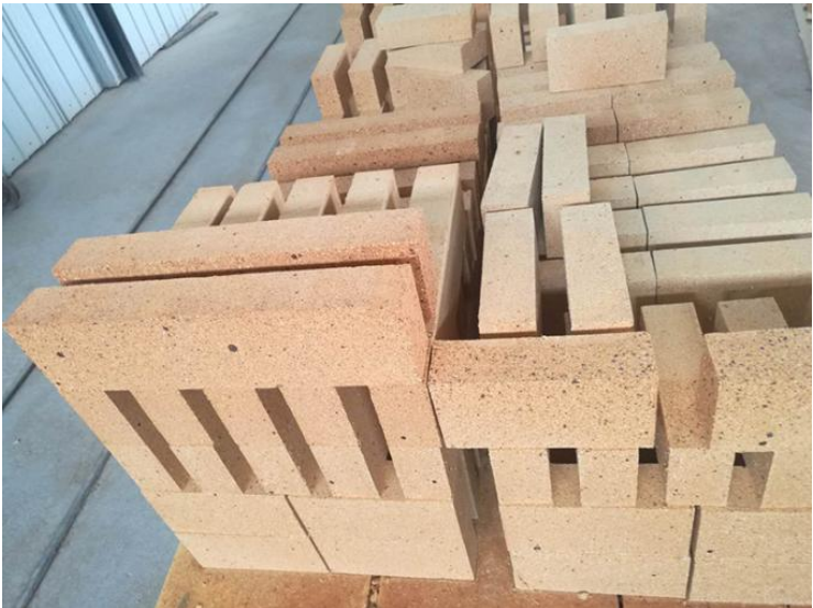
Product Specification of Refractory Clay Brick For High Temperature Industry Kiln