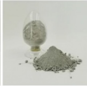
Acid Resistant Castable