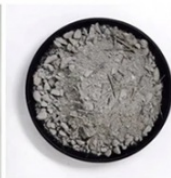
Steel Fiber Reinforced Castable