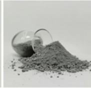
Aluminum Non-Stick Castable