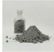
Corundum Wear-resistant Castable

All products can be customized on demand