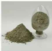
Dense Castable (Traditional )