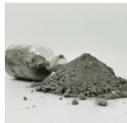
Low Cement Castable