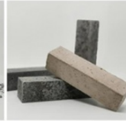
Castable Precast Blocks