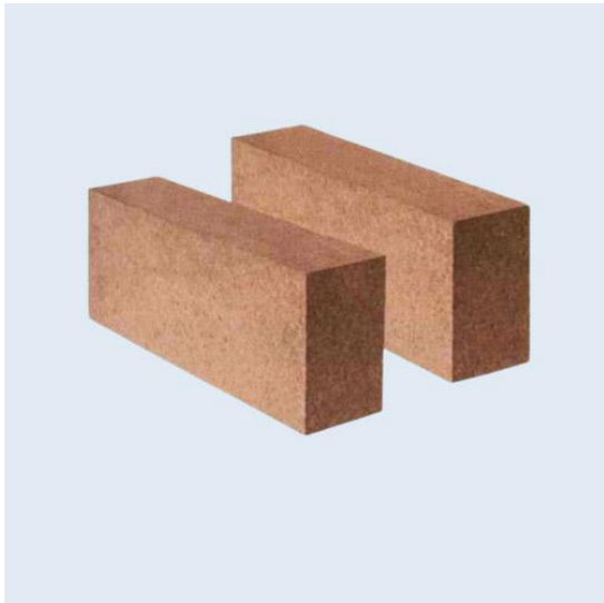
Product Specification of Andalusite Bricks For Hot Blast Furnace