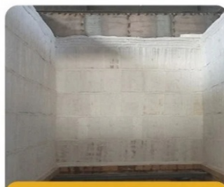
Pallet car furnace