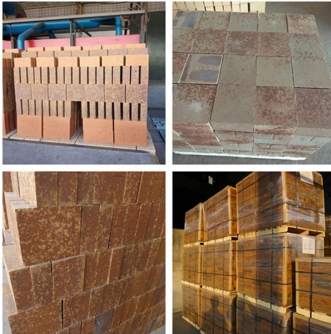
Product Specification of Silicon Mullite Brick