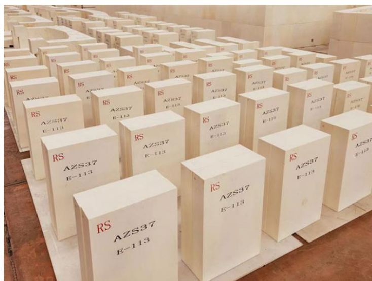
Physical And Chemical Properties of Fused Chrome Corundum Bricks For Glass Kilns: